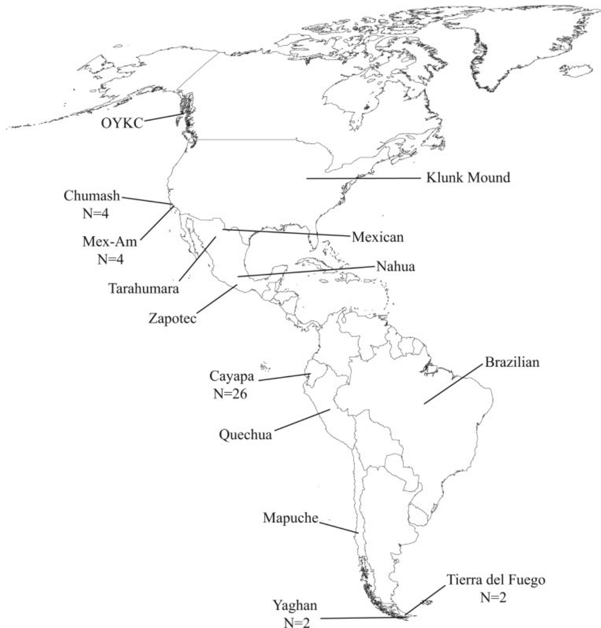
Fig. 1. Map of the Americas that indicates the approximate locations of the On Your Knees Cave individual and related samples. Sample size ( N ) of one at each location unless otherwise noted.

et al., 2002a), is known to belong to the subhaplogroup of haplogroup D containing the OYKC haplotype. This individual's mtDNA exhibits mutations at nps 16223(T) and 16342(C) and matches the CRS (Andrews et al., 1999) at np 16325 (Table 5), mutations common to all of the Native American haplotypes in the OYKC subhaplogroup.