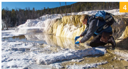
Microbes Dominate Deep Sandstone Formations