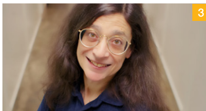
Profile: May Berenbaum