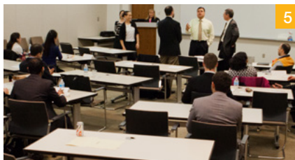
On the Grid: Happenings at IGB