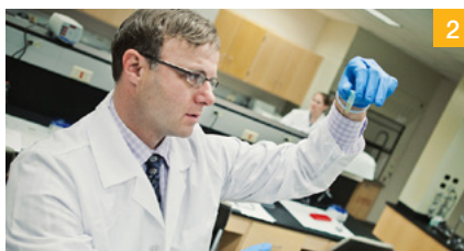
Genomics for Judges: Educating Judges on DNA