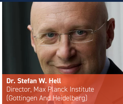
Dr. Stefan W. Hell Director, Max Planck Institute (Gottingen And Heidelberg)